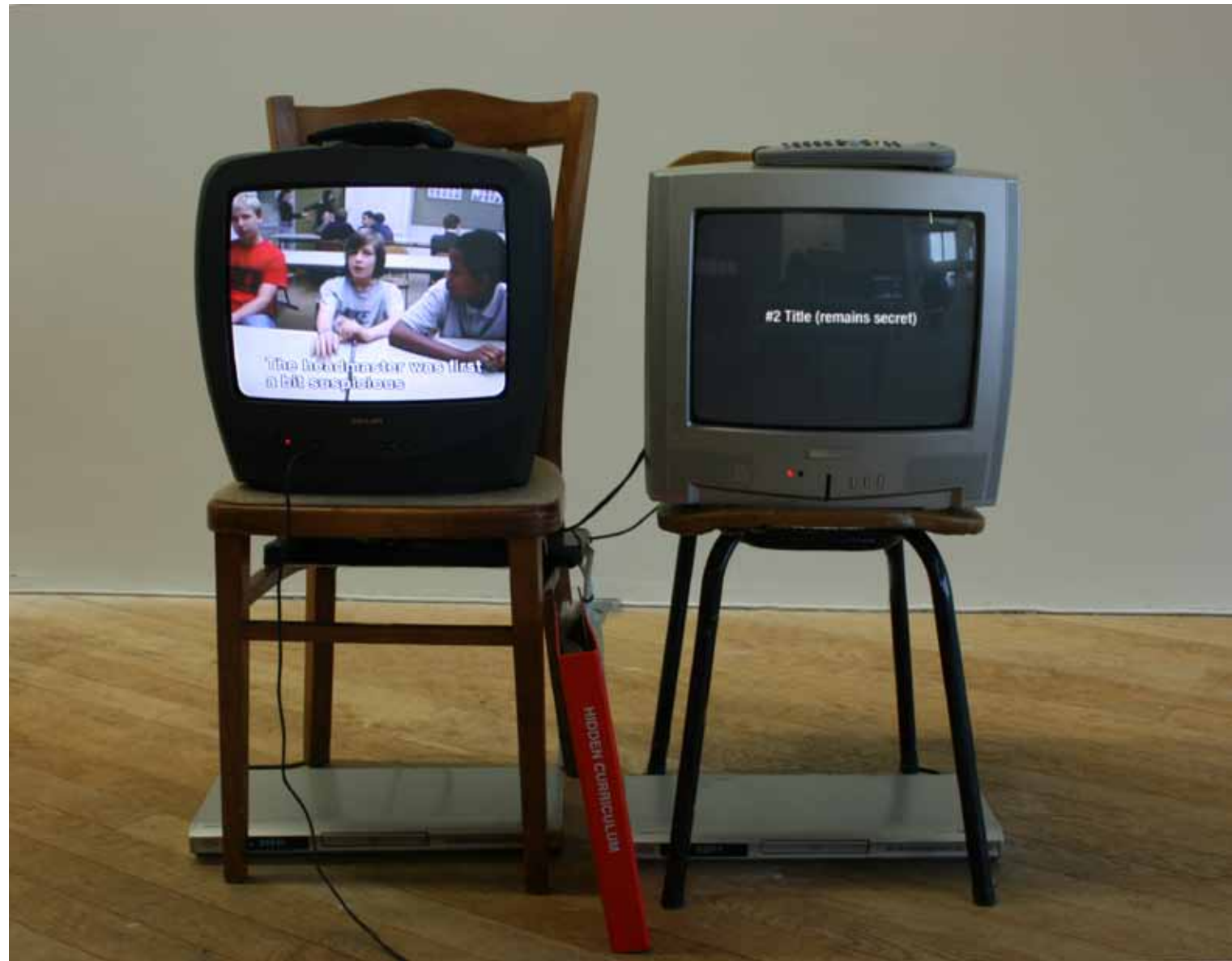
Installation view: Hidden Curriculum Archive, 'We are Grammar', Pratt Gallery, New York 2011

The Hidden Curriculum Archive is an archive made by students for students. In the form of short video sequences it documents secret actions and other practices in order to cope with the daily requirements in school. The archive consists of two parts: The so-called 'public' part, which can be shown at any time publicly (left monitor). The 'secret' part of the archive is only intended for the participants of the current or following Hidden Curriculum workshops (right monitor). The students determine whether and if, which action enters the different categories of the archive.